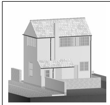
Architect's drawing after restoration