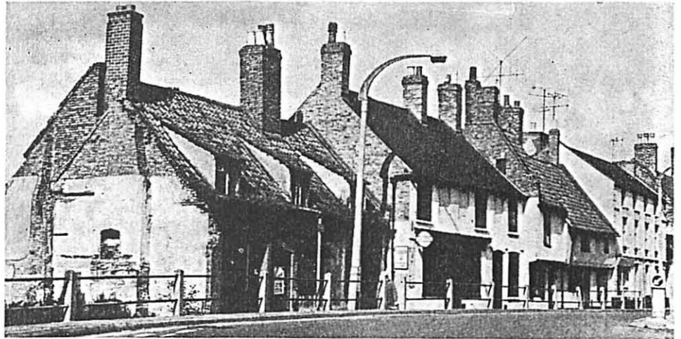
CASTLEGATE COTTAGES, NEWARK. These timber framed cottages, which are sadly derelict, occupy an important site on the A46. In order to resolve the highway situation where road widening proposals have put a planning blight on much of Newark's historic building, the Trust have appealed against planning refusal to renovate these properties