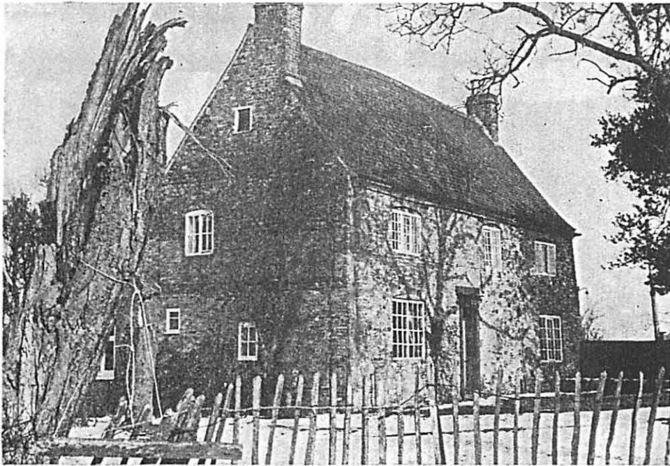
CHURCH SITE FARMHOUSE, THORPE-IN-THE-GLEBE. A 16th Century house, with brick and Skerry facings to a two storey timber structure, with attics, on the site of deserted mediaeval village. This is an important building for which the Trust has offered a small grant for essential renovations