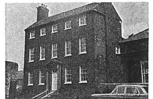
23 MILLGATE, NEWARK. This 18th Century town house stood next to the "Dutch" houses in Millgate, now unhappily demolished. It has been well maintained by its present owner-occupier and is one of the more important buildings in Millgate. The Trust has offered a grant and loan towards roof and gable repair, together with small repairs to the pediment