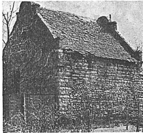
DOVECOTE, NORMANTON-ON-SOAR. Probably mediaeval in date. This Dovecote is built in sandy limestone, with tiers of nesting holes lining the inside of the walls. The gables above eaves level are in brick, probably dating from the 17th Century. The Trust has given a grant towards the re-roofing of the building in Swithland slate