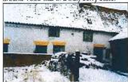
Ranters Farm in 1997