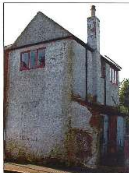
10 Asher Lane, Ruddington before restoration