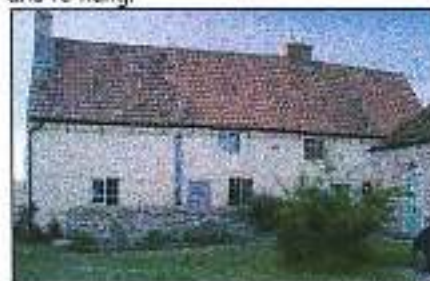
...and after restoration, in 2006

Undertaking most of the work themselves, they extensively restored the oak frame and mud and stud walls, using traditional methods and materials throughout, including lime plaster and lime-wash on the walls, to ensure the building breathes properly. The floors were re-laid in sand without a damp-proof membrane, and the existing windows and doors were repaired and re-hung.