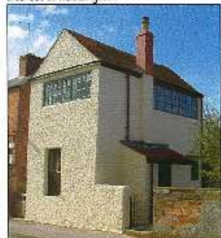
Asher Lane: Restored at last!