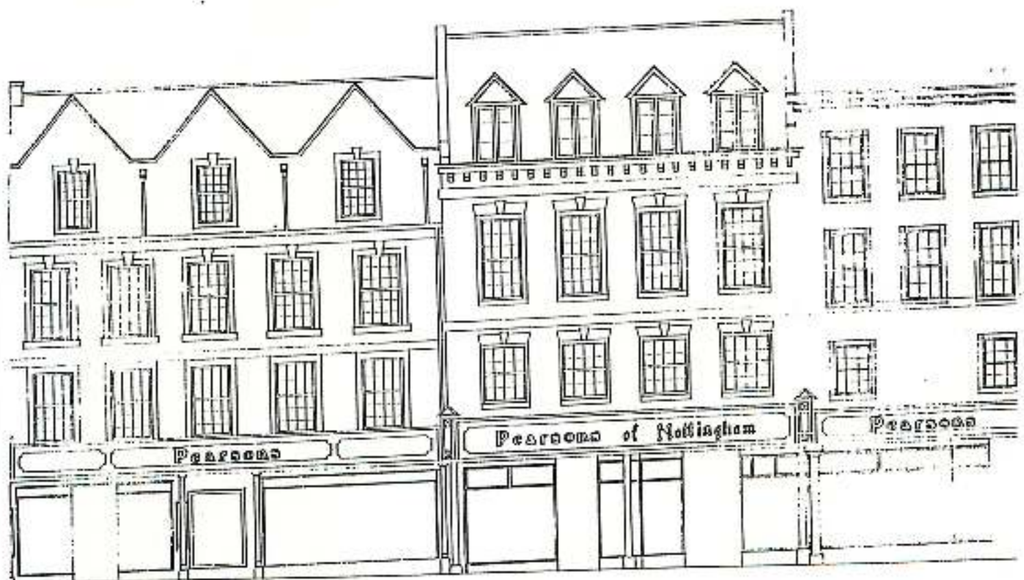
PEARSONS DRAWING BY COURTESY OF BERNARD ENGLE & PARTNERS, ARCHITECTS

The houses and their contents were so well masked by the department store that they were not even listed but, just before Grosvenor Square presented their scheme, a facelift under 'Operation Clean Up' had begun to reveal their qualities once more.