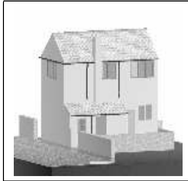
Architect's drawing before restoration