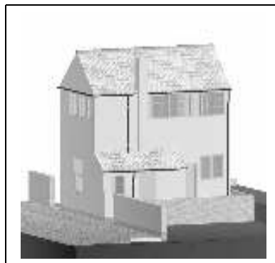
Architect's drawing after restoration