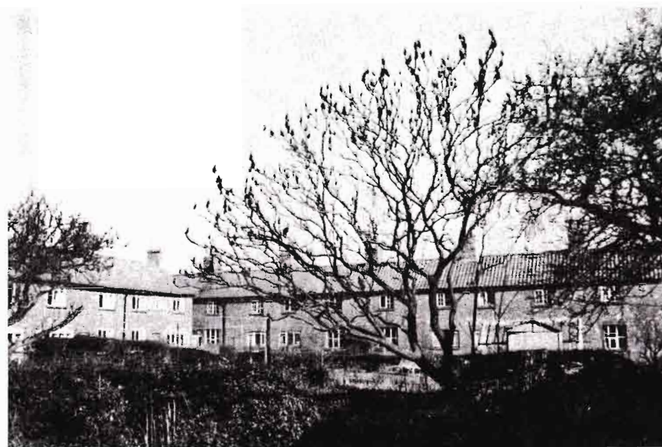
WINDLES SQUARE, CALVERTON

Stockingers Cottages purchased by the Trust for renovation.