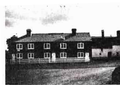
Before and after—schemes of renovation supported by the Trust at Gateford Farmhouse, Worksop, and cottages at Bothamsall