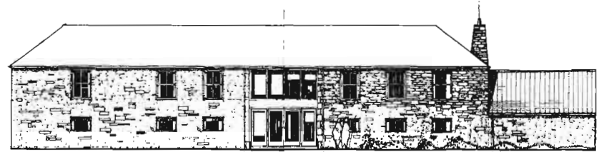
PREPARED FRONT ELEVATION Exposure: East facing with stone wall showing no appearance of any masonry. Windows: three p. marked with axes and soffits.

CONVERSION OF BARN AT COTHAM, near NEWARK, NOTTS. See MR AND MRS J. STANLEY Please see that the basis for this work is the application by B.C.C. (Case 130) offer to purchase