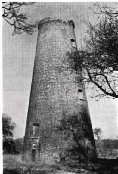
Opposite : East Markham Windmill