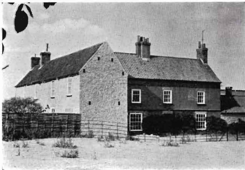
Below : Manor Farm, Cotham