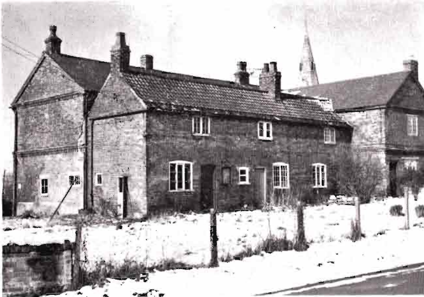
THE MANOR HOUSE, WILLOUGHBY-ON-THE-WOLDS mid 17th century house with later additions . . .