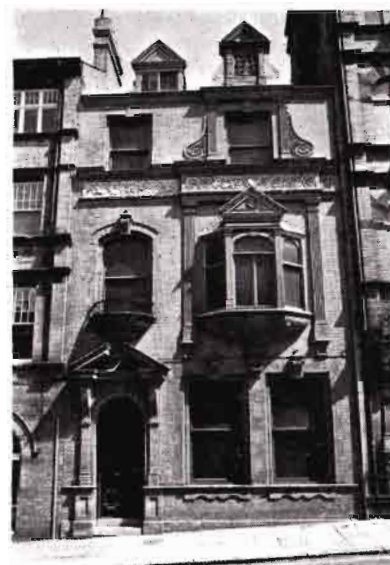
32 Heathcote Street. The detailed facade was restored with a grant from the Trust.