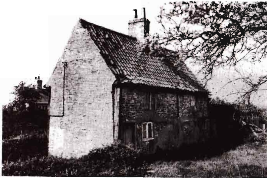
Bankside Cottage, Askham.

A possible future project for the Trust.