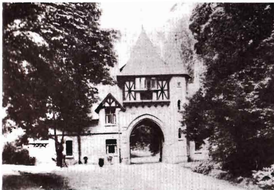
Alexandra Lodge Gate, Bestwood Park.

These Pictures show the building as it was in 1940 and as it was in 1982. Hopefully, it will soon be restored to it's former glory.