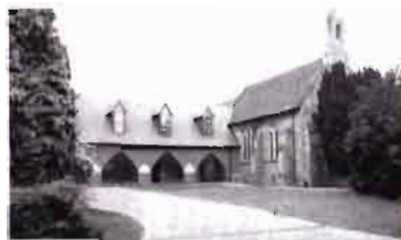
Above: The Thomas Cranmer Centre, Aslockton

The judges' assessment: "A major new building in the centre of the village, set back from the road, remains subordinate to the parish church of St Thomas. High quality brickwork arches and stone dressings suggest its church connections, and the tall roof dormers give a striking appeal and light to a future first floor."