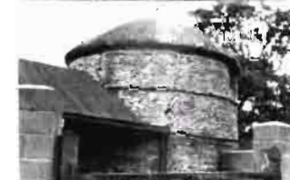
Above: two views of Thoroton Dovecote prior to its acquisition by the Trust.

Among the properties which have come to our attention over the period of this report have been the Manor House at Bingham, Colwick Manor Farm, the Saracens Head at Southwell, the Maltings at Mansfield Woodhouse, South Wheatley Manor, King John's Palace at Kings Clipstone, the Priory at Mansfield Woodhouse, the Old Ship Inn and the French Horn at Worksop, and Wiseton Lodges at Drakeholes.