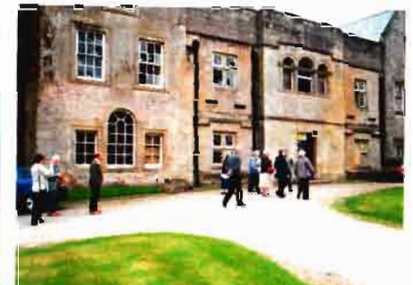
Above: Buildings in which the Trust has maintained an interest over many years include Colwick Manor Farm (above left), top right: Drake Holes Lodges, Wiseton (now restored by the current owner); and (lower right): Annesley Hall, photographed during a visit organised by the Trust.