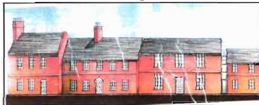
Left: Proposed front elevation. in support of the buildings' restoration in 2002.

Apart from those already mentioned, buildings which have come to our attention include:- St Helen's Church, South Wheatley, the Saracen's Head at Southwell, Colwick Manor Farm, Mansfield Maltings, The Ship at Worksop, Manor Lodge, The Old Library and the Priory Gatehouse at Worksop, Church Lane School at Arnold, 41 Pilcher Gate, Nottingham, the Old Post Office at Bingham and the Hill at East Bridgford.