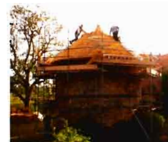
Above: Rethatching in November 2011 by the team from Roger Scanlan Thatching of Northampton