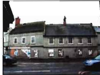
Above: The Robin Hood Hotel several years ago. Its condition is now even worse.

With support from English Heritage, we have strongly opposed the demolition of the 'Robin Hood Cottages' in Newark.