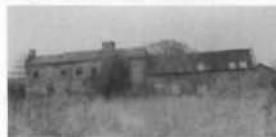
Colwick Manor Farm - derelict for decades

For many years the Trust has been agitating for protection for this building, encouraging Gedling Borough Council to insist on action, without positive result in 2013-14.