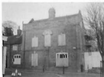
The Manor House, Bingham

Neglect of the Manor House threatened its very existence. The Trust made representations to the Borough Council, liaised with the owner, and took steps to alert local residents to the risk to the townscape of the loss of the building. Having completed a Condition Survey, the Trust proposed its restoration and conversion to a community resource, with a small community hall at the rear, preparing drawings for consideration by the owner and Bingham Town Council.